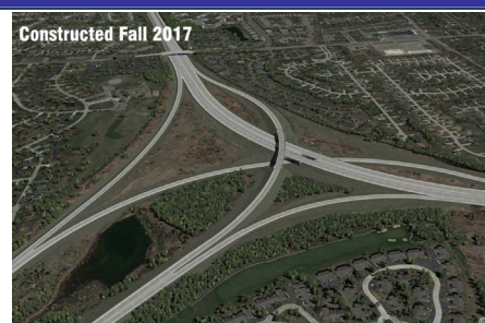
Square Lake Interchange Traffic Plan