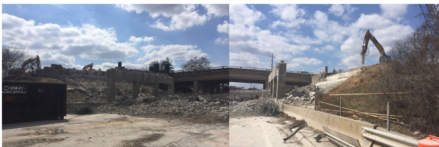
Long Lake Rd. Bridge Demo April 4-8, 2019