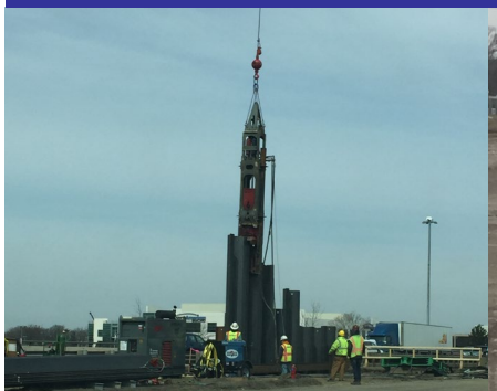
Temp Sheetting at 14 Mile Rd.