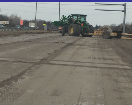
Pavement breaking at Coolidge Hwy.