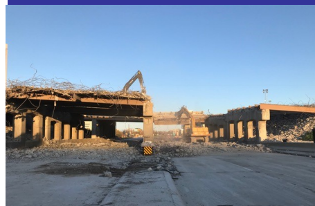
Big Beaver Rd. Bridge Demo