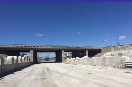
Crooks Rd/Corporate Dr. Bridge Demo