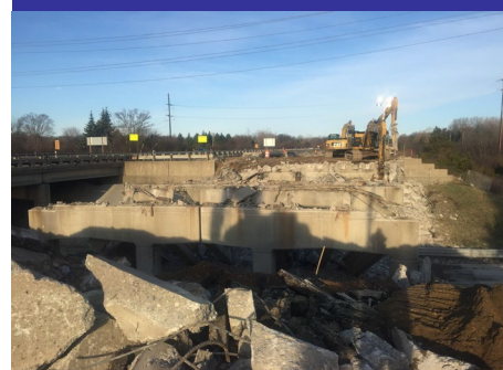
Coolidge Rd. Bridge Demo