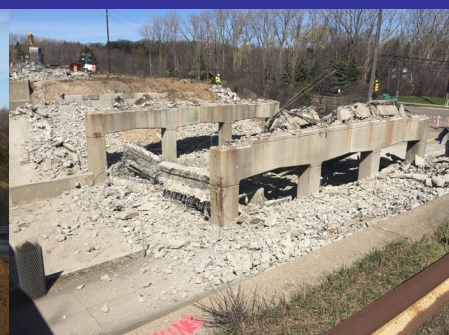
Big Beaver Rd. Bridge Demo