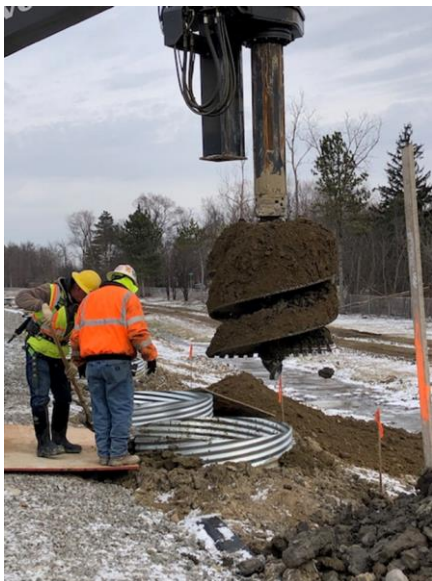
Winter Sound Wall Foundation Work – Drilling holes with auger