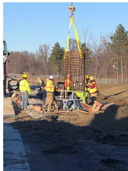
Winter Sound Wall Foundation Work – Placing & Installing pre-tied cages