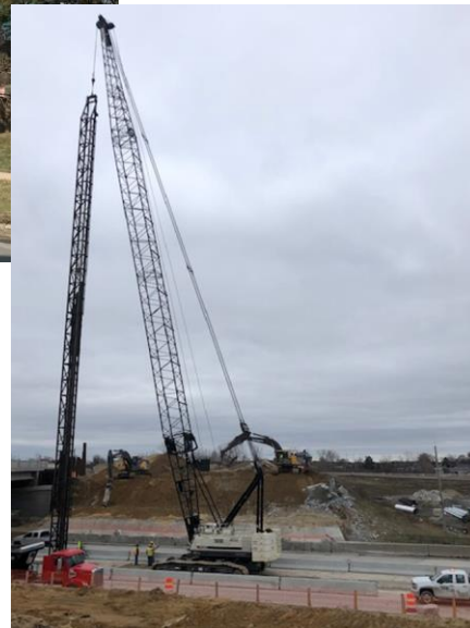
Lifting Pile at Big Beaver