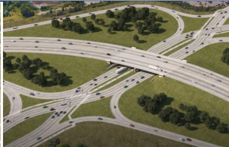
Big Beaver Diverging Diamond Interchange